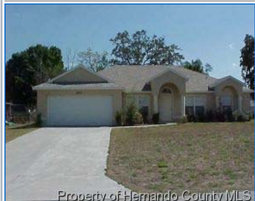
Property of Hernando County MLS

Subdivision: Spring Hill Unit 18 Current Zoning: PDP Acres: .23 Lot Dim. Approx: Lot Dim. Source: Mobile/Manuf Type: N/A Level/Stories: 1 Hernando County Tax Link Contact Property Appraiser (352) 754-4190 Elem. School: Explorer K-8 Mid. School: Explorer K-8 High School: Springstead School Yr-Yr: 2008-2009